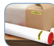
Extra Strength Adhesive Tape