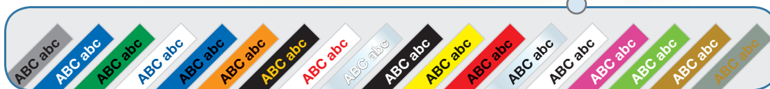
Labels shown are illustrative only. Actual output (such as font and margins) varies.

Creates durable, laminated labels in a variety of colors. Prints big, bold labels up to 18mm wide!