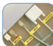
Wire and Cable Tape

For more challenging applications, a number of specialty tapes are also available*