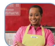
Iron-on Fabric Tape