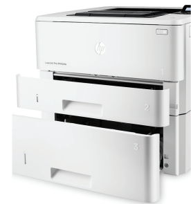
HP LaserJet Pro M402dn with optional 550-sheet tray