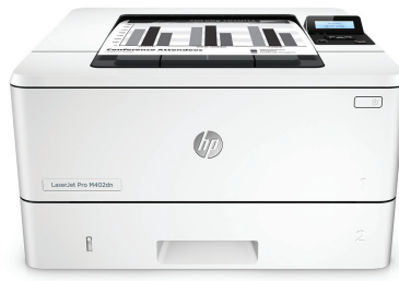
HP LaserJet Pro M402dn

Printing performance and robust security built for how you work. This capable printer finishes jobs faster and delivers comprehensive security to guard against threats. 1 Original HP Toner cartridges with JetIntelligence give you more pages. 2