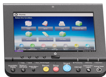
9" Touch-screen Panel