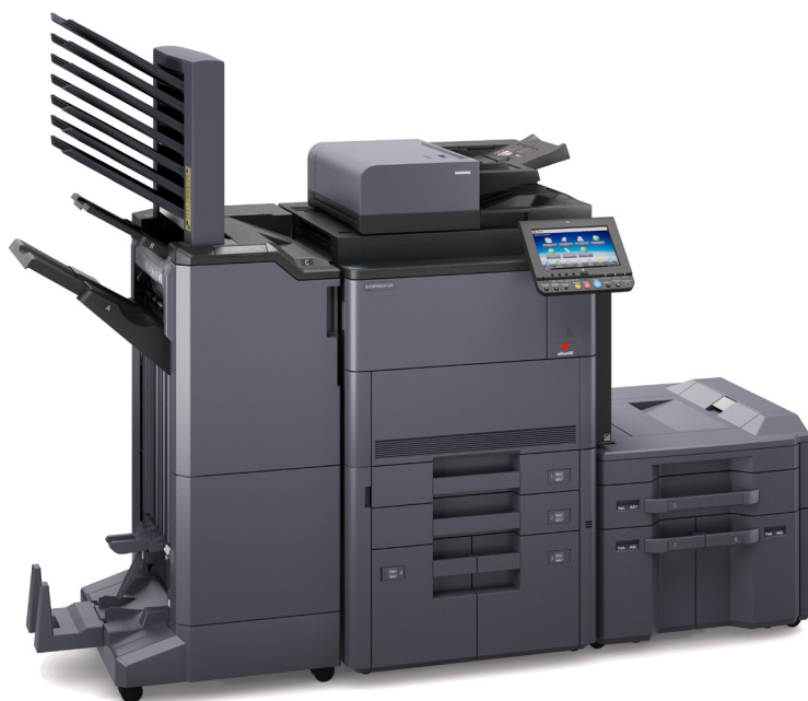
The d-Copia 8001MF with PF-740+PF-7130+DF-7110+MT-730+BF-730 Options