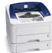
Phaser 3250 shown with optional Tray 2